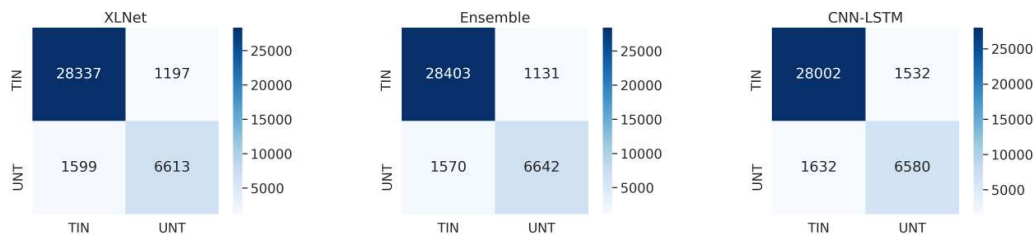
Figure 2: Confusion matrices of top performing models for subtask B

The test set of subtask B consisted of unlabelled 1,422 data points, each required to be predicted as either targeted insult and threat (TIN) or untargeted (UNT). Table 5 shows the performance of our ensemble model using the test dataset.