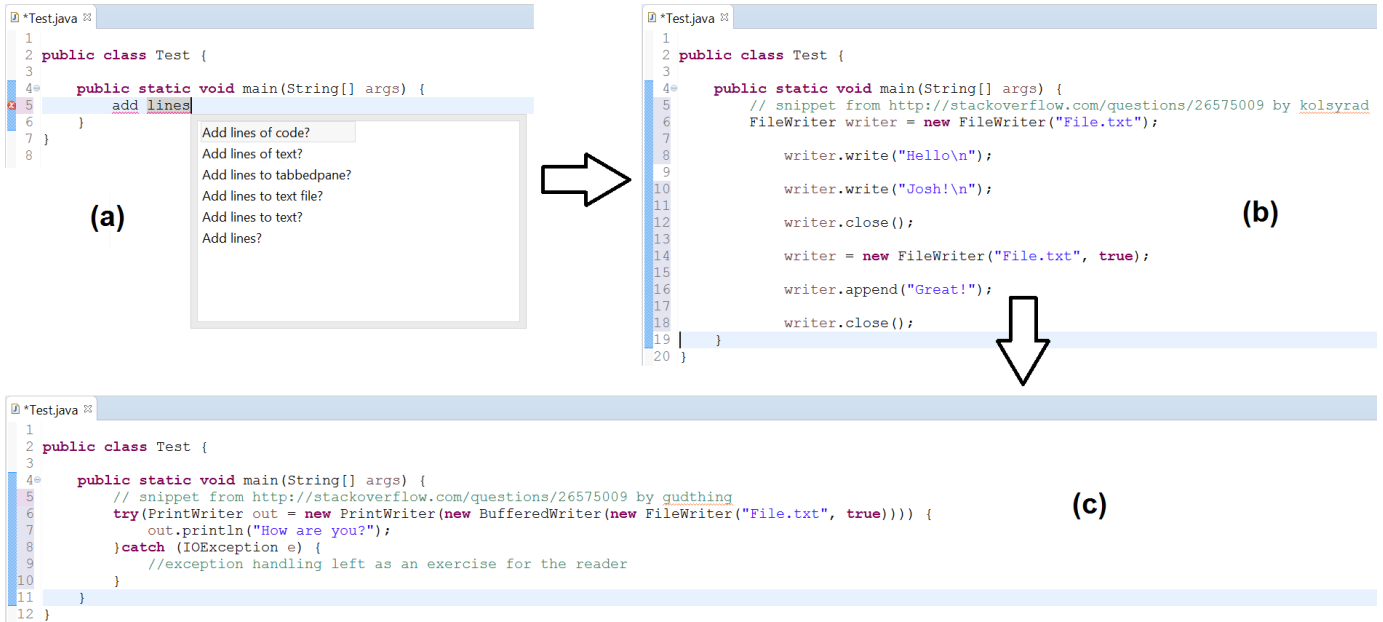
Fig. 2. NLP2Code’s flow. To transition from (a) to (b), select a content assist suggestion, and to cycle through code snippets, such as (c), press Ctrl+’