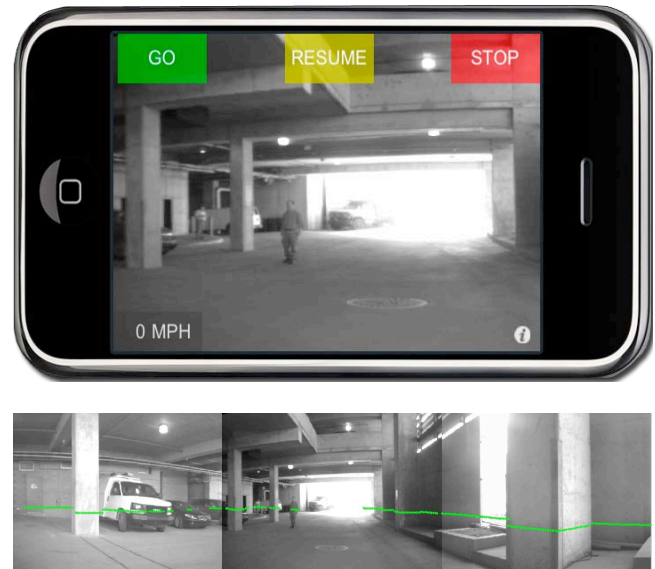
Figure 4. 180 Degree FOV image provides a human friendly interpretation to the LIDAR data processed by the vehicle.

Desire for override authority notwithstanding [3], current technology is not ready to exclude the human from the control loop. Perception systems are still error-prone. For example SICK LIDARs often have trouble detecting black vehicles that have extremely low albedo in the infrared. Of greater concern is the general difficulty of autonomy in unstructured situations, which is sometimes the case in parking lots, as opposed to highways where the behavior of vehicles are much more predictable. At this time, keeping the human in the loop is a requirement.