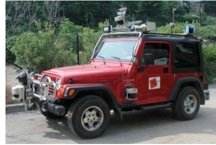
Figure 1. The Navlab11 vehicle.

detection, including six SICK LMS 2-D laser scanners, a custom vehicle state measurement system based around GPS, inertial, and odometry sensors, and various cameras, all mounted on a reconfigurable sensor rack. A small array of on-board computers record and analyze sensor data.