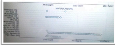
Figure 3: Reflection tool used by P13 (Hereditary Angioedema)

P10 (Epilepsy) had developed what he believed to be an effective way of working with his data. Using the template he had created in Excel, he could compare triggers by sorting and filtering the data. The amount of control that Excel provided for him allowed him to reflect on his data in a way that was meaningful to him personally. “This helped me to see that, while one trigger might not cause a seizure, a combination likely would... This spreadsheet allowed me to reduce my medication simply by avoiding triggers.”