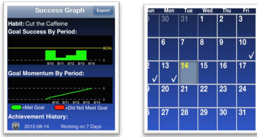
Figure 2: Reflection tools used by P6 (Depression)