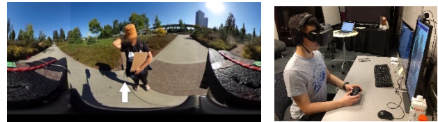
Figure 2. The VR view of the 360° live-video feed, as it was presented to the viewer through the smartphone-VR setup.

We recruited 14 pairs of participants (4 Female-Female, 8 Male-Male, 2 Female-Male) within an age range of 19 to 39 years (avg=24) through snowball sampling. All participants knew each other before the study; two were romantic couples and the rest were pairs of friends. 20 of our participants were students from university and 8 others had different jobs such as bank teller, designer, etc. 10 people had experience with geocaching and only 2 of our participants had used a telepresence robot prior to the study.