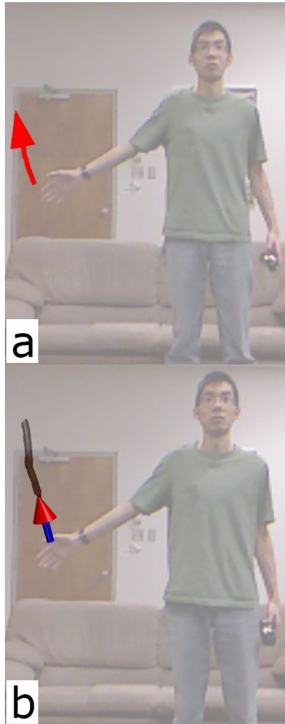
Figure 2. Our arrow guides: (a) is the 2D arrow. (b) is the 3D arrow.