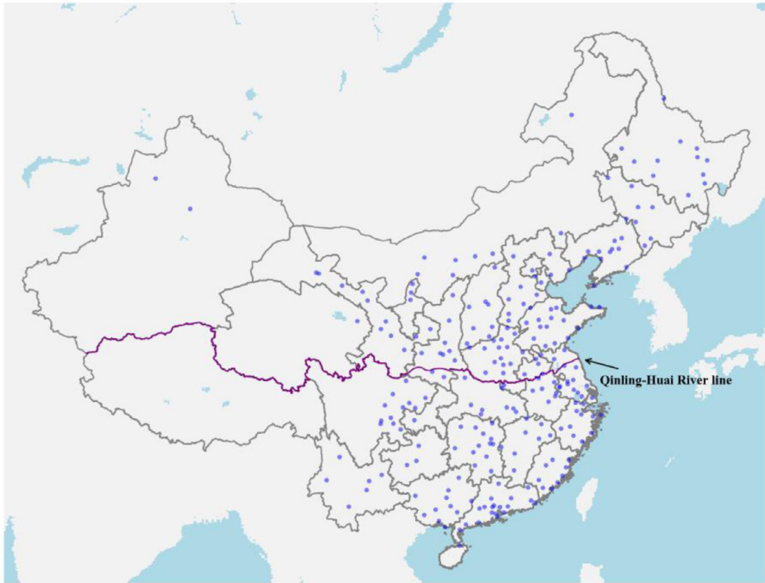
Fig. 1. Locations of cities and the Huai River in China. The figure plots the geographic location of the cities covered in our sample in China. Each city is represented by one dot on the map. The line in the middle of the map is the Huai River augmented by the Qinling Mountains, which geographically divide China into its southern and northern parts.

This adverse behavior may lead to the development of any number of neurodegenerative diseases, including Parkinson's disease, Alzheimer's disease, or Gulf War Illness." According to this description, severe air pollution can have both an immediate influence and a long-term impact on mental and cognitive conditions.