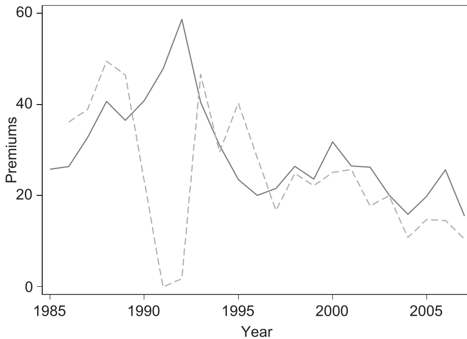
Panel B: Average yearly premiums for club LBOs and non-club LBOs