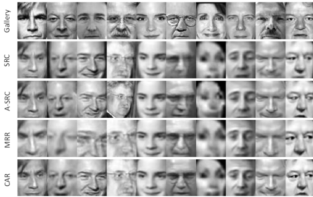
Figure 3. Gallery faces and average faces from videos before and after alignment. SRC shows the average of original video faces from a face detector using its quality alignment result; and A-SRC(RASL), MRR, CAR show the average faces after their respective alignments.

\eta = 25 . The regularized parameter \lambda in sparse representation and collaborative representation is set to 3 and 0.05 respectively. The other parameters of MRR are set as follows: \eta_1 = 25, \eta_2 = 40, S = 25 . The iteration number of seeking the optimal solution in RASL, MRR is set to 25. The iteration number of coarse searching in CAR is 13, while that of fine searching is 12.