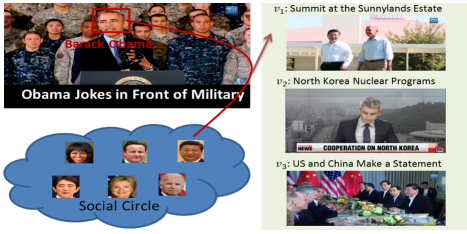
Figure 1: An example of linking Obama to his social circle. Each celebrity (e.g., Jinping Xi) in the circle is further linked to diverse videos elaborating different perspectives of the relationship with Obama.

sulting in the problem of “link explosion” as mentioned by [1]. One exception is the work by [18], which emphasizes serendipity in hyperlinking, by constructing a deep topical structure of 10 hierarchies for weighting the contribution of videos based on topic specificity. Therefore, videos of different granularities in topics could be selectively recommended, which effectively controls the number of videos for serendipitous hyperlinking. Our demo is similar in spirit to [18], specifically to recommend limited but diverse videos useful for exploration, but operates in the domain of social circles. Potentially there are rich information (e.g., anecdote, event, rumor, opinion) to be exploited for hyperlinking in this domain, which are yet to be studied. Particularly, concerning the utility of hyperlinks for helping users navigate in large scale media collections.