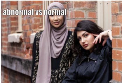
Figure 1: Example of hateful meme.

memes to perform the classification tasks [28, 47]. Others have explored fine-tuning large-scale pre-trained multimodal methods to perform hateful memes classification [12, 28, 31, 37, 49, 54, 57]. Nevertheless, these existing methods have limited explainability and cannot reason the context embedded in the hateful memes.