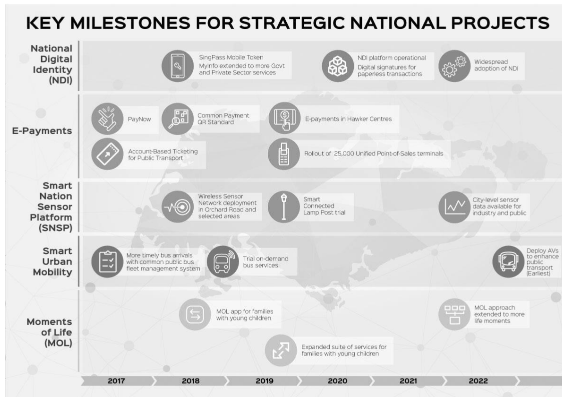
Figure 2: The Smart Nation Initiative's Key Milestones

Source: GovTech Singapore: Strategic National Projects to Build a Smart Nation 13