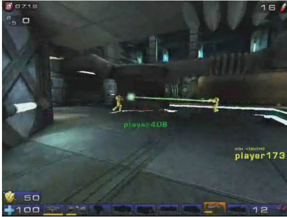
Figure 2: A snapshot of Unreal Tournament.

Unreal Tournament 2004 (UT2004) is a commercial game, which could be used as an environment for embodying virtual agents. One great thing about this game is its extensibility. Users can make modifications to the game, like the one used in the 2K Bot Prize competition. In this competition, the DeathMatch game type is used. Figure 2 shows a screen shot from the recorded video of the 2K Bot Prize competition (from the view of the judge).