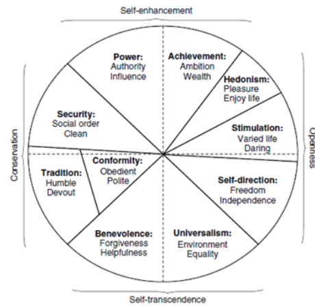
Figure 1: Circular Structure of Schwartz’s Personal Values (Maio 2010)

the personal values. The key idea is to exploit the circular structure of Schwartz’s personal values. This Stack Model is a two-layer model which supports features derived from both LIWC and S-LIWC. The model yields accuracy higher than most of the earlier state-of-the-art prediction models.