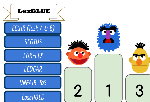
Figure 1: LexGLUE: A new benchmark dataset to evaluate the capabilities of NLU models on legal text.