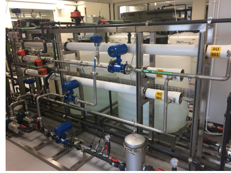
Figure 1: The Secure Water Treatment (SWaT) testbed

Summary of Contributions. We present active fuzzing, a black-box approach for automatically discovering packet-level network attacks on real-world CPSs. By iteratively constructing a model with active learning, we demonstrate how to overcome enormous search spaces and resource costs by sampling new examples that maximally improve the model, and propose a new algorithm that guides this process by seeking maximally different behaviour. We evaluate the