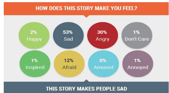
Figure 1: The emotion distribution generated by “mood meter” on a news article

DOI: http://dx.doi.org/10.1145/2911451.2914759