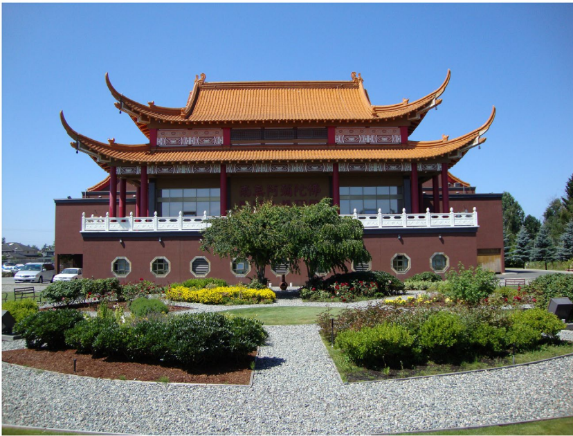
Figure 4. Lingyen Mountain Temple, No. 5 Road.

This narrative of supportive municipal multiculturalism was also evident in congratulatory speeches from civic leaders at the temple's opening ceremony.