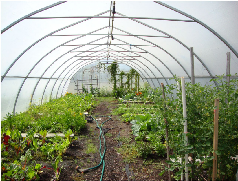
Figure 2. Vegetable cultivation at Dharma Drum Buddhist Monastery, No. 5 Road.

Vancouver, with the realization of permanent structures taking many years of community fundraising. Alongside the larger buildings remain more provisional spaces such as the simple wooden structure of the Subramaniya Sway Hindu Temple. While most of the institutions are monocultural an interesting exception is the shared campus, opened in 1997, which houses the Richmond Bethel Church, originating in a German farming community in the 1950s, and the Richmond Chinese Mennonite Brethren Church. The initiative, and primary financial contribution, for the shared facility came from the Chinese church, which relocated to No. 5 Road in 1997.