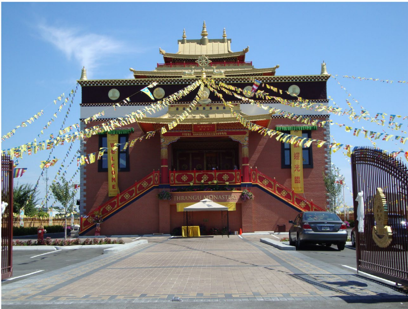
Figure 3. Thrangu Tibetan Buddhist temple, No. 5 Road.

So an initial zoning policy, intended as a compromise between the needs of local faith communities and concerns about safeguarding agricultural land from suburban sprawl, had produced a distinctive site within greater Vancouver for the location of religious buildings. Land values in the Assembly District have increased 20 preventing smaller communities from purchasing sites. The 1990 planning policy has unintentionally shaped the location of a range of new and expansive religious institutions, catering for more widely dispersed worshippers.