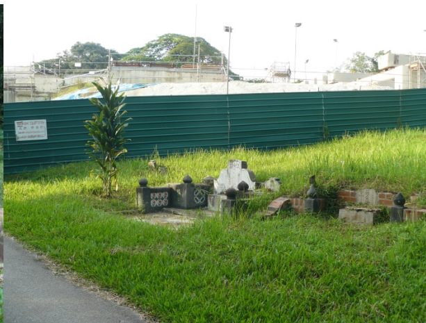
Figure 6. Construction of the eight-lane highway at Bukit Brown Cemetery (Author's photograph, 2017)