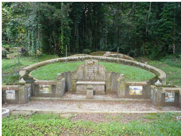
Figure 5. Shrine at Bukit Brown Cemetery (Author's photograph, 2017)

Brown Cemetery , by the National Heritage Board, Roots: a Documentary on Bukit Brown , by Singapore Polytechnic); exhibitions ( The Bukit Brown Index ); 8 theatre plays and performances; 9 and dedicated websites by heritage groups ( All Things Bukit Brown ( http://bukitbrown.com ), and SOS Bukit Brown ( https://sosbukitbrown.wordpress.com/ )). 10