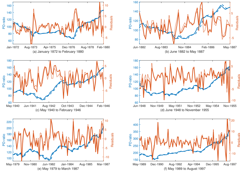
Figure 1: The unbroken and dashed blue lines are time series plots of the actual and fitted monthly PD ratios (left axis), where the fitted value is obtained by an AR(1) regression with an intercept. The unbroken and dotted red lines are time series plots of residuals from a fitted least squares autoregression and exact local Whittle (ELW) estimation of the long memory parameter (right axis). See the text for further details.

Although data y_t generated by (3) follow a unit root process driven by strongly dependent errors, it is not uncommon to observe realizations that form time paths with episodes mimicking an explosive trajectory. Solving (3) gives the partial sum representation y_t = \sum_{i=1}^t u_i + y_0 . Since u_t is strongly dependent with representation (4) and moving average coefficients c_{dj} > 0 for all j , it is evident that any large positive shock \varepsilon_{t-j} provides a sustained positive impact on y_t due to strong dependence. Since y_t is the cumulative effect of such inputs, a succession of positive shocks produces an upward trend in the process that can mimic an explosive time series.