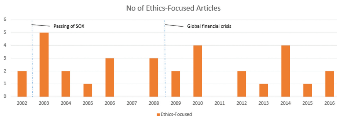
FIGURE 1. Number of ethics-focused articles published from 2002 to 2016

Also, in the aftermath of the global financial crisis in 2008/2009, there were 6 ethics-focused articles published in 2009/2010, comprising 0.95% of total publications