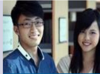
Lee Kong Chian School of Business