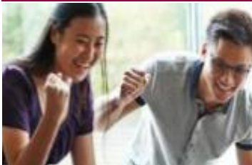
School of Law