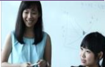
School of Economics