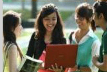
School of Social Sciences