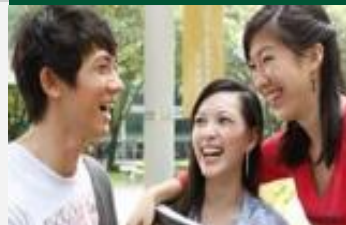
School of Information Systems