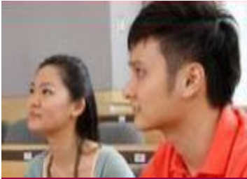
School of Accountancy