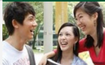
School of Information Systems