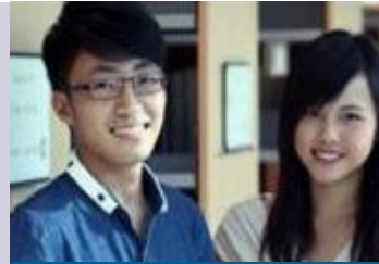
Lee Kong Chian School of Business