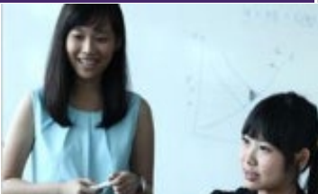
School of Economics