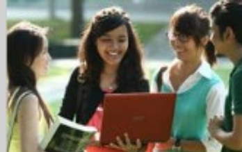
School of Social Sciences