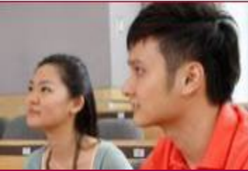
School of Accountancy