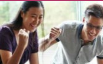
School of Law