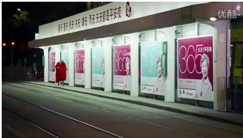
Figure 4. Spring, summer, autumn or winter, rain or shine—every day can bring a peaceful night.