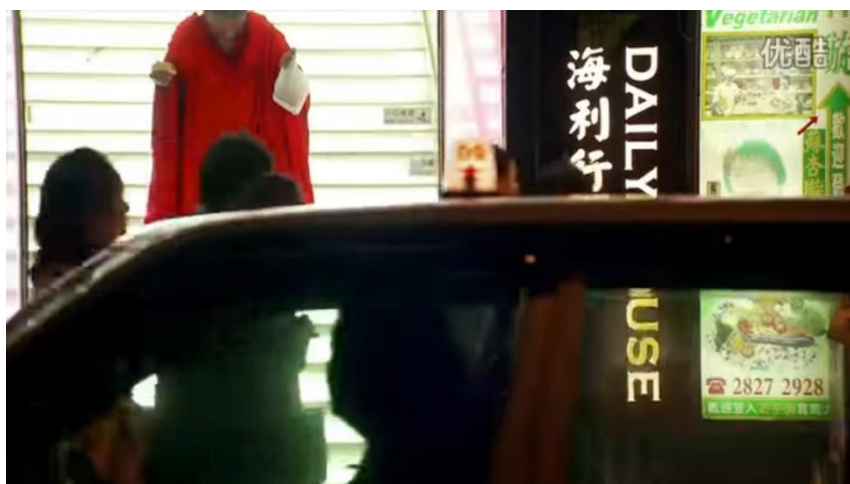
Figure 3. Transitory traffic, intransient walker.

Indeed, whereas Menzan advises that kinhin be practiced in a “quiet place” within the monastery, the walker brings an oasis of quietude into the restive clamor of the city, grounding each shot with a still, meditative presence (Riggs 2008, pp. 242, 244). In Zen iconographic terms, the solitary, stubborn simplicity of Tsai’s walker (qua Xuanzang) recalls the figure of a bull, whose movements allegorize “steps in the realization of one’s true nature” (Reps and Senzaki 1994, p. 241). This brings us to a core aspect of the Buddhist discourse at work in the film’s slow aesthetics. In Mahayana Buddhism, liberation is attained not by active striving, but rather by awakening to the reality of the tathagatagarbha (Skt: “matrix of the Thus Gone”), that is, the Buddha Nature inherent in all things. For Dogen, this innate Buddhahood is paradigmatically realized through zazen or sitting meditation. Given the indivisible “oneness of practice and attainment” (Jpn: shusho itto ), the practice of sitting actualizes the enlightenment that one already possesses. But for Menzan, the act of walking becomes the chief performative embodiment of Buddha nature. According to David E. Riggs, Menzan’s focus on kinhin plays upon an alternative reading of kanji characters that, in their broader usage within the Japanese Buddhist context, simply refers to the four basic physical positions that the Buddha himself took (Riggs 2008, p. 224). 4