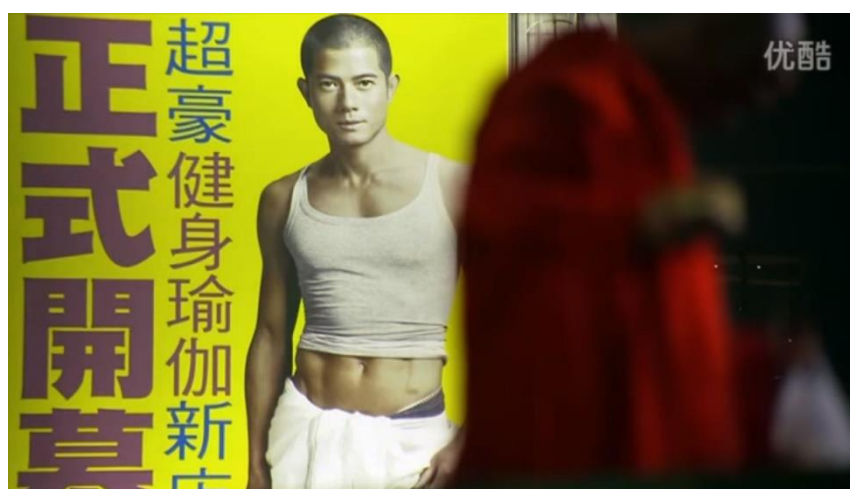
Figure 7. Perspectivist camera trick rendering (the images of) two performers the same size.