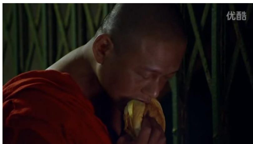
Figure 10. Mindful eating.

Accepting that he can proceed no further than where he already is, in the last shot the walker begins to eat the bun that he has been holding in his hand all this while (see Figure 10). In his slow, simple mastication, the “prospect of vitality” (Duffy 2009, p. 7) and “heightened, intensified way of life” (Jones 1915, p. 157) driving the modern fetishization of speed finds an alternative telos in what we might call the mysticism of the mundane. Here, Tsai is in concert with contemporary proponents of mindful eating, who identify this practice as an ideal path through which human appetites can “be transformed from a source of suffering to a source of renewal, self-understanding, and delight” (Bays 2009, p. 5). By affirming and appreciating basic physiological activities like walking and eating, the film seems to say, moderns can rediscover the sheer joy of simply being alive.