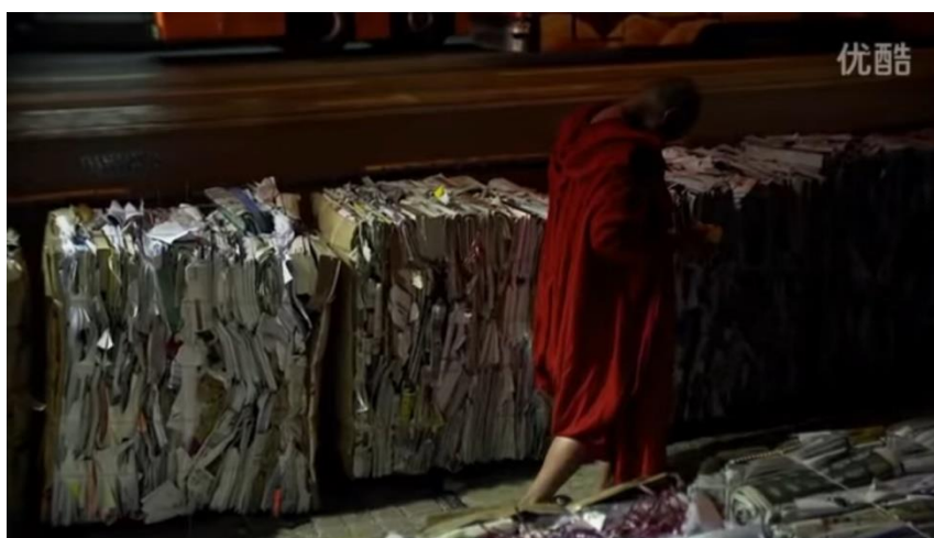
Figure 1. A homeless wanderer.

To begin with, the walker's very form stands in prophetic counterpoint to the enterprise of modernity. His vermilion robe, bald pate, and bare feet are starkly juxtaposed against the backdrop of neon-lit billboards and towering skyscrapers bespeaking Hong Kong's position as a global economic hub. In contrast to the cellphones and cameras sported by numerous passers-by, the humble bun and plastic cup in the walker's hands call to mind the alms bowl carried by mendicant monks, intimating the simplicity and poverty of the renunciate life. 2 By his sheer presence in the Chinese metropolis, he functions as a living icon of the Buddhist tradition in the contemporary world. The walker's iconic import is underscored by the fact that he remains anonymous and itinerant throughout the film. As he makes his way through a deserted street lined with stacks of waste paper after dark (see Figure 1), he cuts a poor and lonely figure, embodying the ascetic ideal of the homeless wanderer that has been one of the most "defining features of the history of Buddhist monasticism" (Gethin 1998, p. 99). Even so, although looking quite out of place during the hustle and bustle of every day, he seems placidly at home in the city at night, when most human activity has come to a cessation.