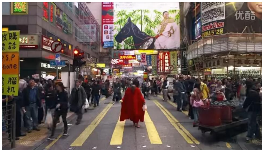
Figure 2. Self-reflexive performativity on a pedestrian crosswalk.

In the spirit of the Kinhinki , which warns its readers to “not drift into the bustle of the practices of another family,” Walker proposes an alternative to the hectic immoderations of modern life by approaching the conventional standards of walking meditation with creative fidelity (Riggs 2008, p. 233). Where the rule of looking ahead aimed at fostering meditative focus, Tsai’s walker squarely casts his gaze downward, oblivious to the countless advertisement posters, signboards, and digital screens bespeaking consumerist distraction. With a touch of self-reflexivity, the shot of him on Mongkok’s Sai Yeung Choi shopping street—a permanently pedestrianized street when the film was made in 2012—shows him performing kinhin specifically on a crosswalk (see Figure 2). In this way, the film “focuses on the ground” and “discloses the hustle and bustle of the city [in] counter-consciousness to this business” (Finnane 2016, p. 127). Further, where Menzan’s admonition to “go straight ahead and return straight” directly opposed the Obaku ritual of circumnavigating effigies of the Amida Buddha, the walker roams across Hong Kong without any obvious agenda or destination (Riggs 2008, pp. 234, 243). In sharp distinction to the busy, purposed pacing of other pedestrians, the walker’s aimless kinhin evokes the levity of the proto-Zen Zhuangzian sage who “wanders free and easy in the service of inaction” (Watson 2013, p. 50).