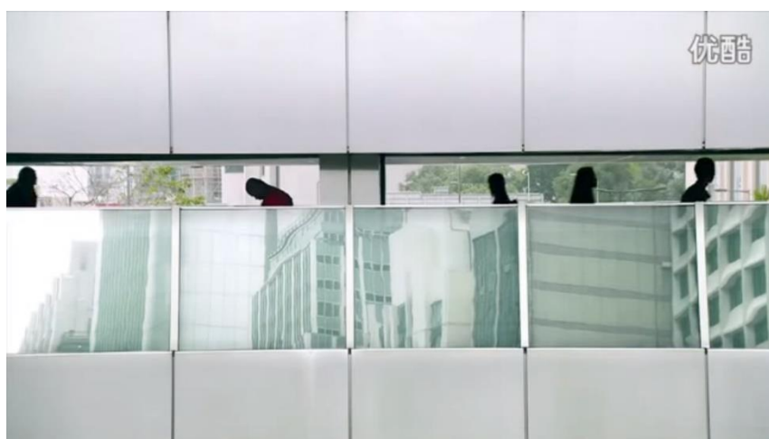
Figure 8. The walker amidst the flow of human traffic in Hong Kong's Central Business District.