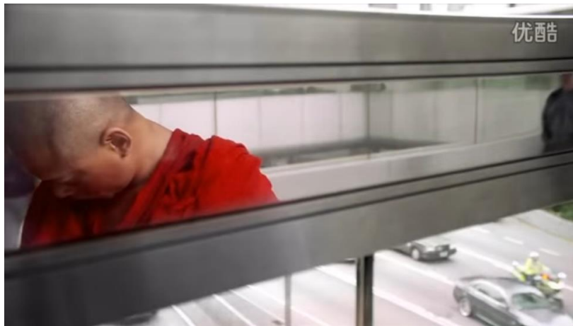
Figure 9. A window of reflection.

Having traversed the myriad terrains of the city, the walker’s journey finally comes to a stop in the penultimate shot. Flanked by two stacks of undelivered newspapers that signal an impending dawn, he finds himself halted in front of firmly-locked metal grills. To the extent that the walker’s journey hitherto this point has partaken in the toils and travails of modern life, his stopping before a “NO ENTRY” sign—like the empty scriptures that Wu Cheng’en’s Xuanzang initially obtains when he finally arrives in India—allegorizes the Zen dictum that one need not search or travel far for deep meaning and fulfilment. In the walker’s decisive stillness, he embodies an admonition from Linji Yixuan (fl. 9th century) that applies as much to moderns as it does to monastics: “What are you seeking as you go around hither and yon, walking until the soles of your feet are flat? There is no Buddha to seek, no Way to attain, no Dharma to obtain” (Sasaki 2009, p. 27).