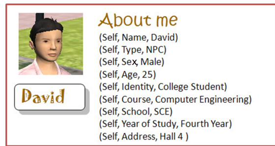
Figure 4. An example of agent profile model.

Knowledge of Self: Besides the desire, intention and personality, a virtual agent should be aware of its identity, background, and current activities. Such knowledge of self is represented using the Concept-Relation-Concept (CRC) tuples [20], which are generic in form and easily expandable. A sample set of the agent self-knowledge is shown in Figure 4.