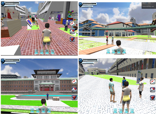
Figure 3. A player touring the NTU Co-Space.

As illustrated in Figure 3, a player can roam around the virtual NTU campus on his/her own for self-discovery or interact with autonomous virtual humans or other players. Besides showcasing the intelligent agent technologies, the NTU Co-Space can be played by any prospective students and general public who are keen to know NTU. A video clip of the NTU Co-Space can be viewed on YouTube ( http://www.youtube.com/watch?v=bYIthOYjrxw ). During the user trial, multiple players will be able to log in and experience the NTU Co-Space concurrently.