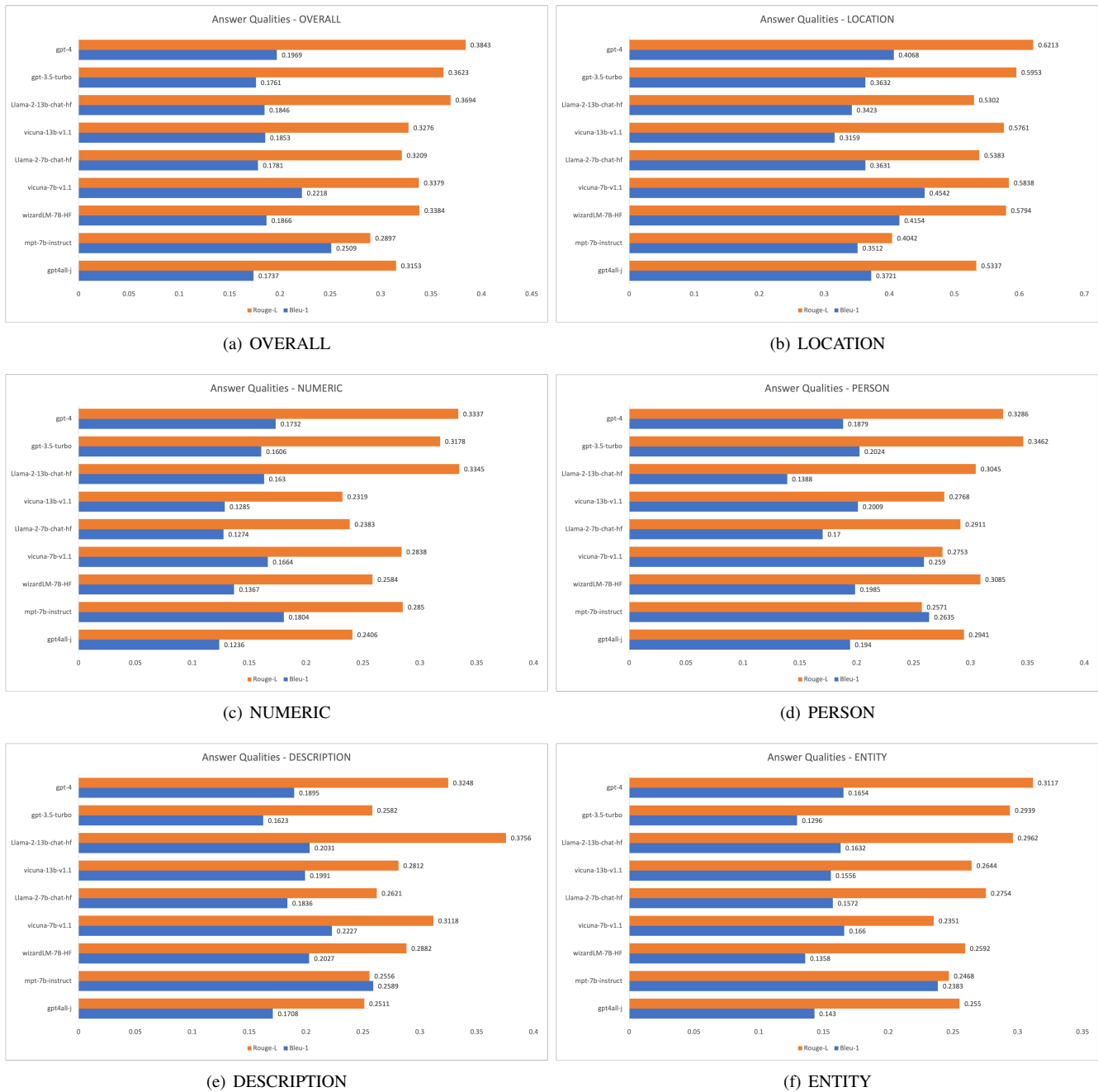
Fig. 2. Answer Qualities (running on Nvidia A40 GPUs)

Comparatively, Llama-2 models stand out amongst other open-source LLMs.