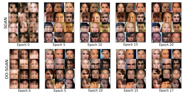
Figure 1. Training images with fixed noise for SGAN and DO-SGAN/P (pruning) until termination. Both during training and after convergence, DO-SGAN/P can generate better quality images with FID score of 6.32 against SGAN's FID score of 6.98.

to generate more realistic samples [23, 27, 28] as well as regularization techniques [1, 25]. From the game-theoretic perspective, GANs can be viewed as a two-player game where the generator samples the data and the discriminator classifies the data as real or generated. They are alternately trained to maximize their respective utilities till convergence corresponding to a pure Nash Equilibrium (NE).