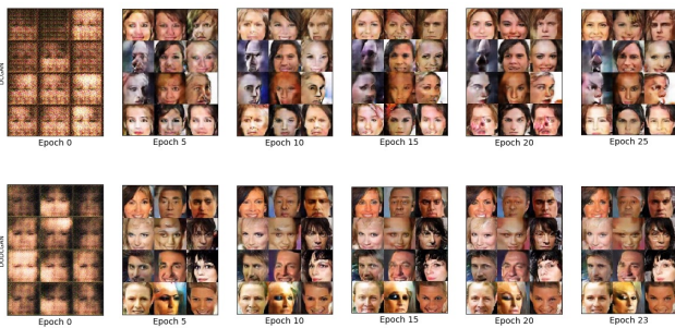
Figure 4. Training images with fixed noise for DCGAN and DO-DCGAN/P until termination.

We choose the CelebA dataset for the qualitative evaluation since the training images contain noticeable artifacts (aliasing, compression, blur) that make the generator difficult to produce perfect and faithful images. We compare performances of DO-DCGAN/P, DO-SNGAN/P and DO-SGAN/P with their counterparts. SNGAN which is trained for 40 epochs with termination \epsilon of 5 \times 10^{-5} for DO-SNGAN/P where other architectures are trained for 25 epochs with termination \epsilon of 5 \times 10^{-5} for DO variants. The generated CelebA images of DCGAN and DO-DCGAN/P are shown in Figure 4 where we find that DCGAN suffers mode-collapse, while DO-DCGAN/P does not. We also present the generated images of SNGAN vs DO-SNGAN/P using fixed noise at different training epochs in Figure 5. From the results, we can see that SNGAN, SGAN, DO-SNGAN/P and DO-SGAN/P are able to generate various faces, i.e., no mode-collapse. Judging from subjective visual quality, we find that DO-SNGAN/P and DO-SGAN/P are able to generate plausible images faster than SNGAN and SGAN during training, i.e., 17 epochs for DO-SGAN/P and 20 epochs for SGAN. More experimental results on CIFAR-10 and DO-GAN/C variants, which can produce competitive results, can be found in Appendix F