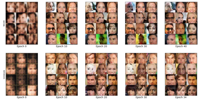
Figure 5. Training images with fixed noise for SNGAN and DO-SNGAN/P until termination.

FID Score. Fréchet Inception Distance (FID) measures the distance between the feature vectors of real and generated images using Inception_v3 model [9]. Here, we let p and q be the distributions of the representations obtained by projecting real and generated samples to the last hidden layer of Inception model. Assuming that p and q are the multivariate Gaussian distributions, FID measures the 2-Wasserstein distance between the two distributions. Hence, FID Score can capture the similarity of generated images to real ones better than inception score.