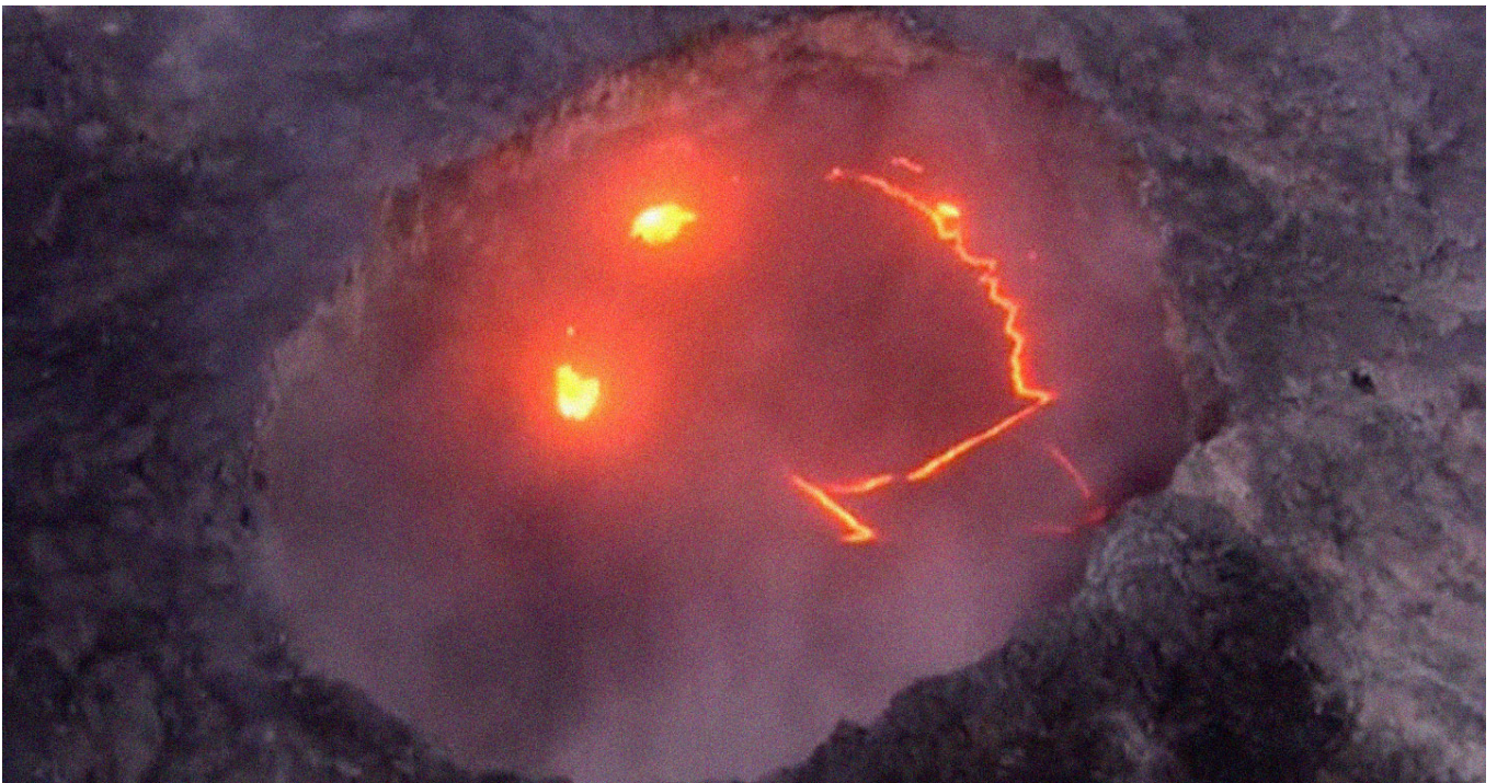
A smiley face appears in a Hawaiian volcano's crater during an eruption during 2016.