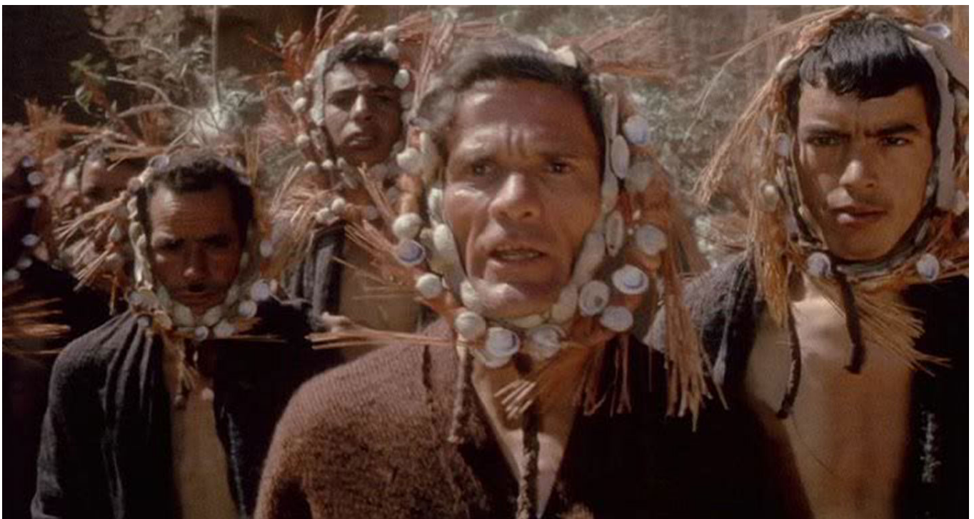
Filmstill from Pier Paolo Pasolini's 1967 movie Oedipus Rex .