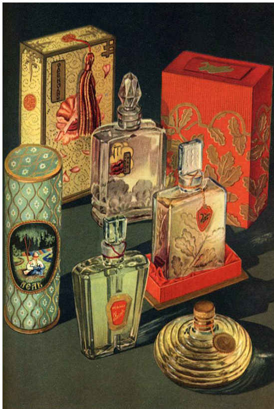
A selection of perfume is featured in this illustration from a Soviet commodity catalog published between 1956-61.

The earth is local movement in the desegregation of the universal. Here's the door to the earth with no return home and who will walk through it is already back, back of beyond,