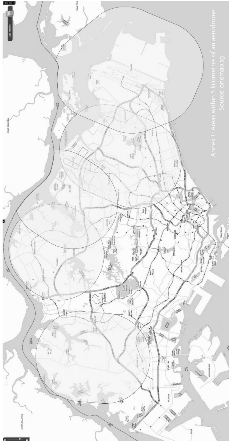
Annex 1: Areas within 5 kilometres of an aerodrome