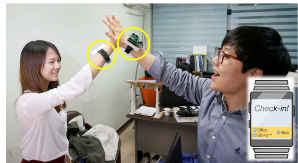
Figure 1. Doing a high-five with High5 prototypes and an application mockup

http://dx.doi.org/10.1145/2632048.2632072