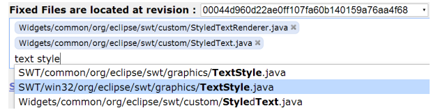
Figure 2: Recording Fixed Files Information

Usage Scenario. Figure 1 shows the interface of the bug report view page of Bugzilla when BugLocalizer is enabled and used. We show the interface when a bug report has been processed resulting in a list of top- k files that are deemed to be most likely to be buggy among files in the latest commit of the project’s git repository. As shown in the figure, a user can pick a source code version whose files will be searched to identify buggy ones (by selecting a version from “Git Tag Version” drop down list). After choosing the version, the user can click “Localize” button to request for bug localization to be performed on the chosen source code version based on the summary and description fields of a bug report (these fields are not shown in the figure). A background script will then asynchronously send a request to the server (i.e., server-side component), inform the user that the request is currently being processed, and wait for the server