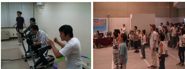
Figure 4. Playing Swan Boat (left) and U-theater (right)

Prior to the event, we expected that the unique fun factors obtainable from PSD-based games were two-fold: the gesture-based game plays and the group gaming experience. From these standpoints, the players have shown behaviors closely concurring with our expectation. Moreover, a notable discovery is that both fun factors are not just valid but also highly correlated. To be specific, the gestures, which are the prime modes of interaction in PSD-based games, essentially enable active social interaction. As the game interactions are merged with into natural motions, our games give more freedom of motions than classical games. Particularly, relieving eyes and limbs of excessive game controls enables intensive interaction with neighbor players involving eye contacts and physical signals. Even though those players are actually from different schools and do not know each other, playing physical activities together seems to expedite ice-breaking and promote conversations.