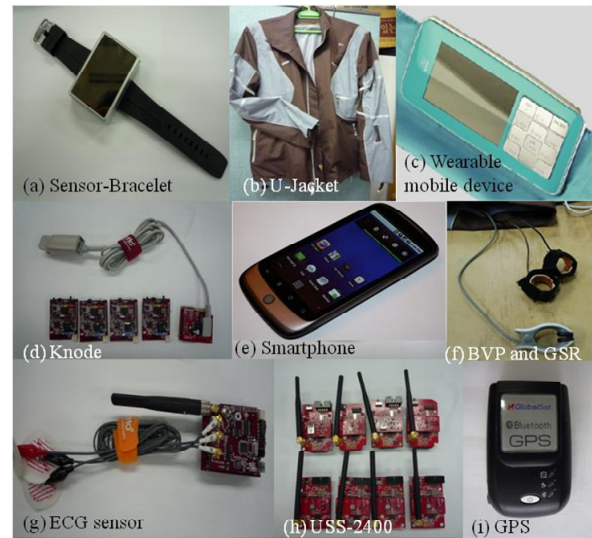
Figure 3. PSD prototype hardware settings

The game input balancer is designed to enable pervasive game players to closely synchronize with each other with