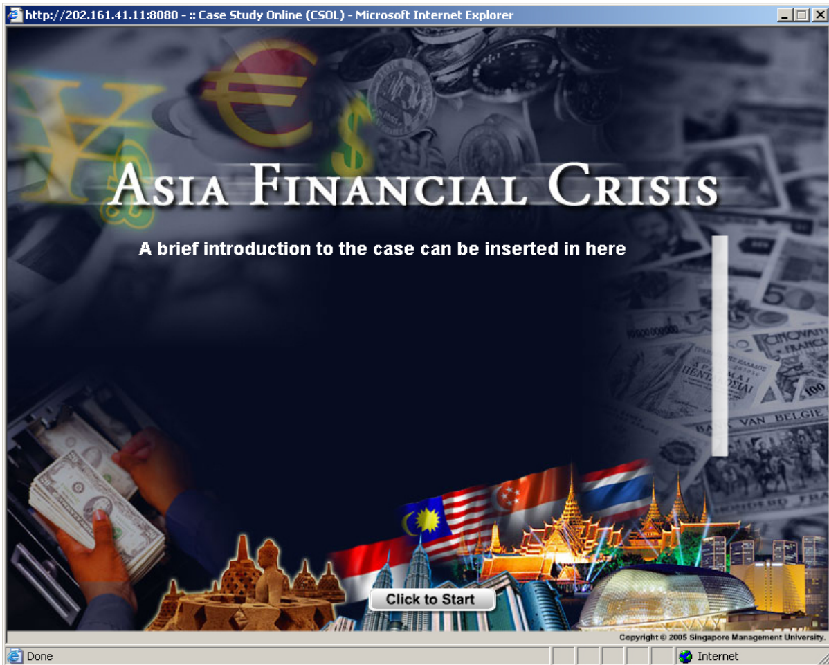
Figure 2: The Introduction page contains a brief synopsis of the case study.

Second, clicking on the “Read Me” tab brings the student to a page that specifies the learning objectives and instructs on procedural matters. Third, the student accesses the case study and assignment by clicking on the “Interactive” tab (Figure 3).