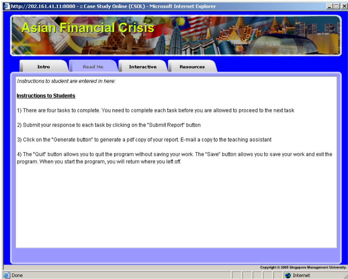
Figure 1: There are four tabs in CSOL.

The tabs are sequenced in a manner that moves the student through a process of learning activities. First, clicking on the "Introduction" tab brings the student to a page that provides a brief synopsis of the case study (Figure 2).