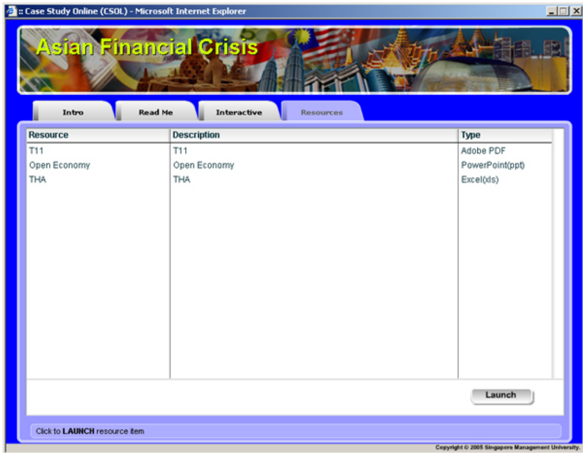
Figure 4: The “Resources” Tab is a repository of teaching materials.

The fourth tab is the “Resources” tab. It provides the student with a repository of resources that can include power point slides, economics data and article readings (Figure 4). With the repository feature, instructors can set tasks that require students to explore or search actively for answers, always within the boundaries and scope defined by the instructors.