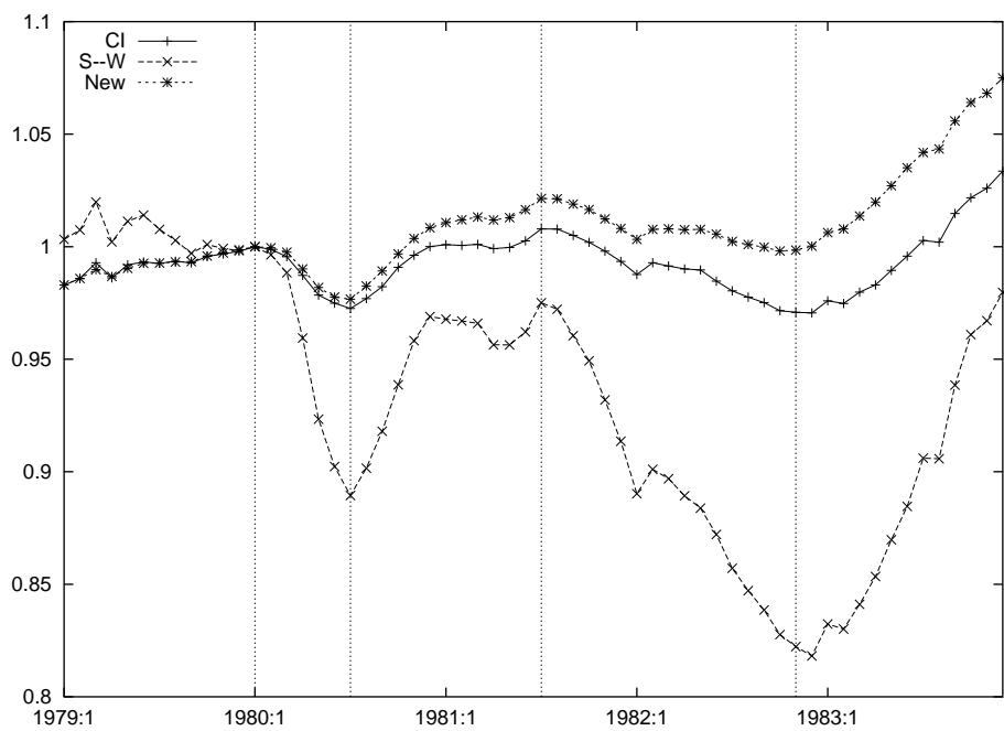
Figure 3: Comparison of Alternative Indices from 1979 to 1983 (1980:1=1). The vertical lines are the NBER business cycle reference dates.