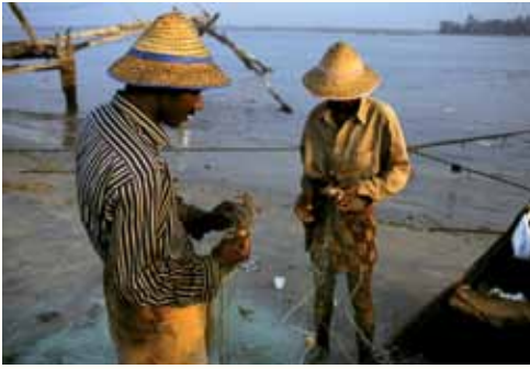
Fishermen in Fort Kochi, Kerala