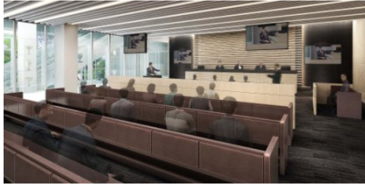
Images 5(i) and (ii)