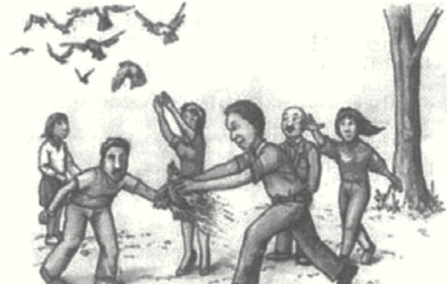
A Bird in the Hand Is Worth Two in the Bush