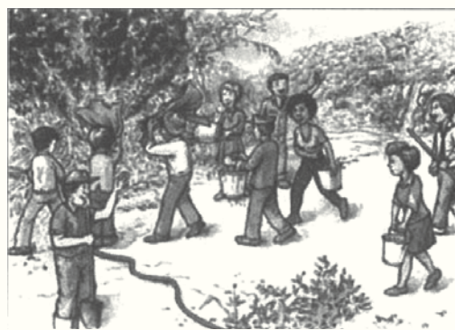
In Unity Lies Strength