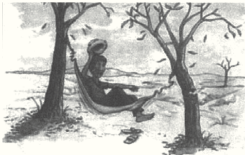
When the Sun Rises We'll See