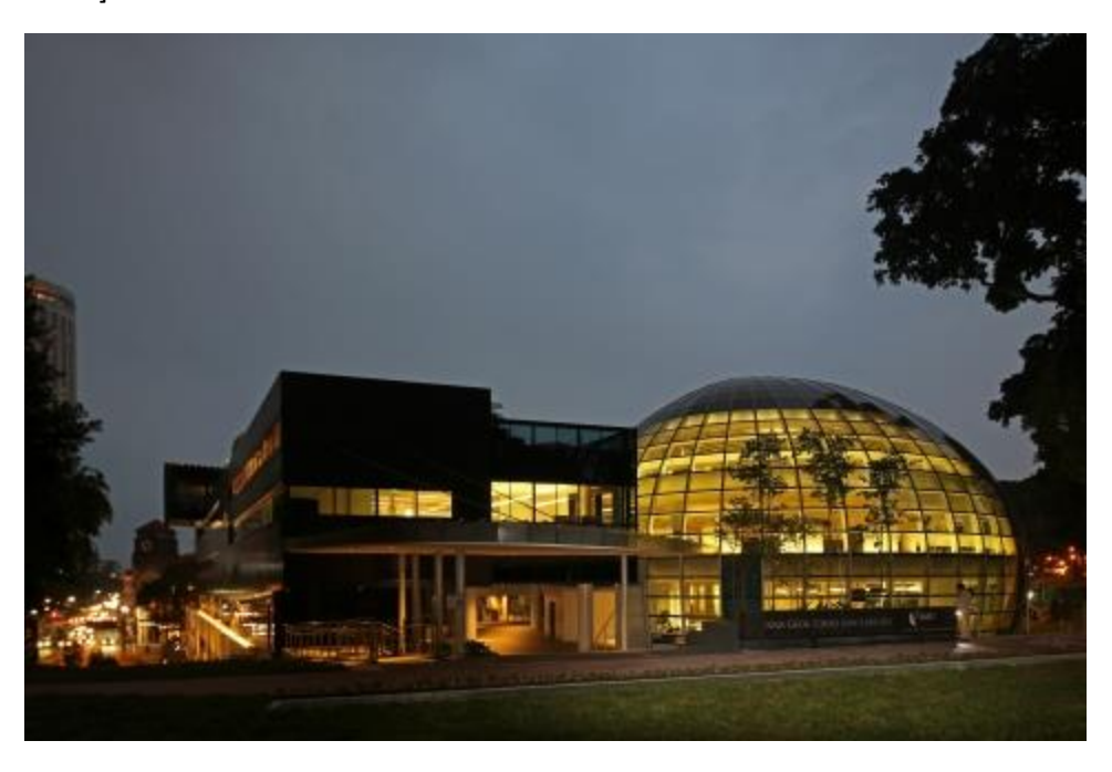
[Photo: Kwa Geok Choo Law Library, reminscent of a pearl, glowing softly into the night.]