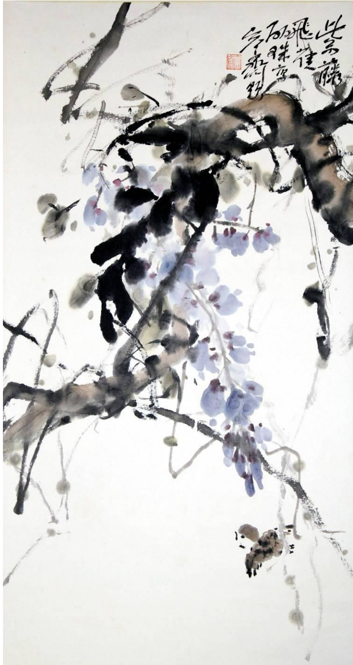
Tan Lay Choo Wisteria Chinese ink and pigment on paper 68 x 47 cm 1992