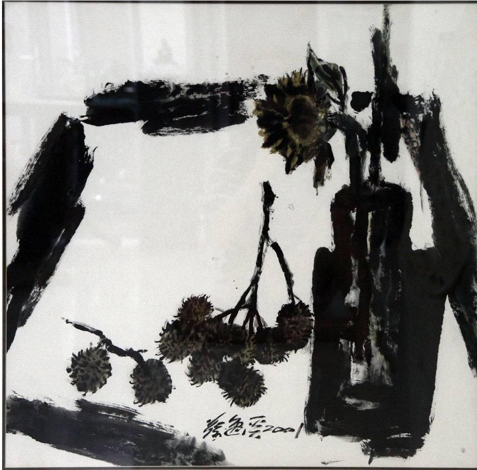
Chua Ek Kay Rambutan and Sunflower Chinese ink and pigment on paper 69 x 69 cm 2001