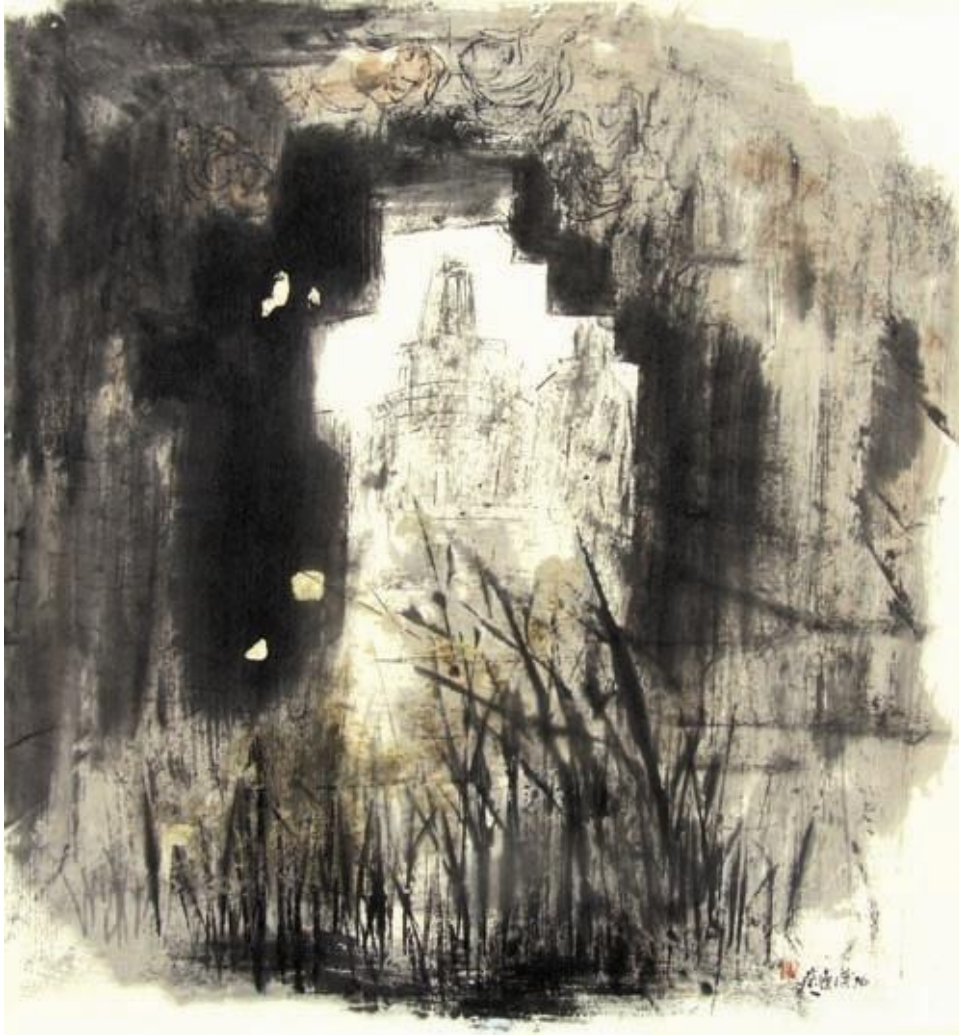
Chua Ek Kay Moonlight at Borobudur Chinese ink and colour on paper 96.5 x 90 cm 1996