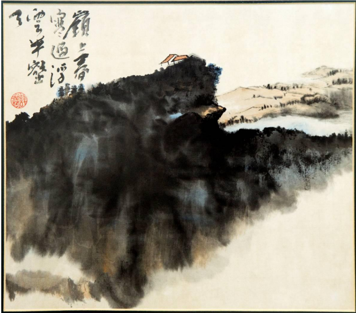
Hui Fong Chee Landscape Chinese ink and pigment on paper 35 x 37.5 cm 2000