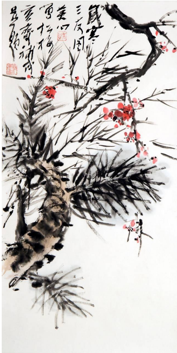
Kong Mei Sing Ushering in the Spring Chinese ink and pigment on paper 70 x 35 cm 1989