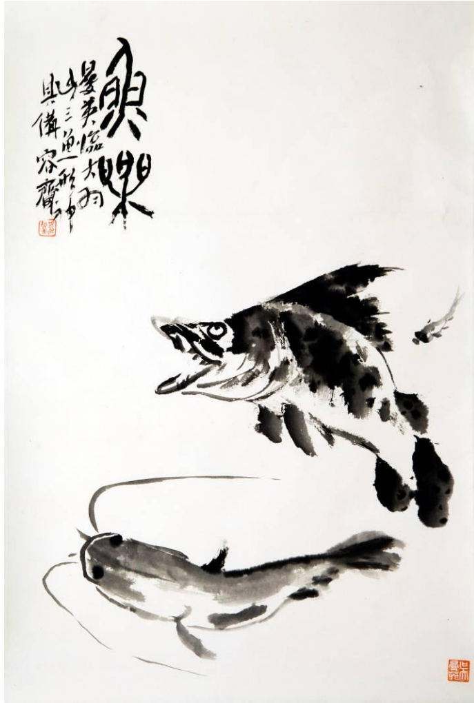
Goh Ban Eng Joyful Fish Chinese ink on paper 68.5 x 45.5 cm 1995