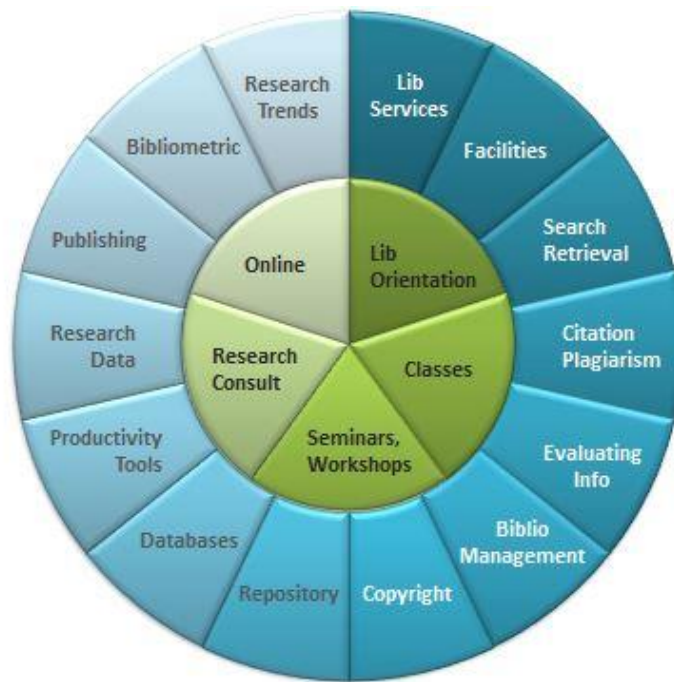
Figure 3. A Proposed IL Framework for Postgraduates

The proposed Framework (see Fig. 2) consists of two circles and divided into wedges. The inner circle represents the mode of delivery. The existing modes of delivery; Library Orientation, Classes, Seminars/Workshops, Research Consultation and Online Self-help Materials; are used to form the inner circle. The outer circle depicts the contents that are delivered through IL Programmes. Again, existing contents are used to form the outer circle.