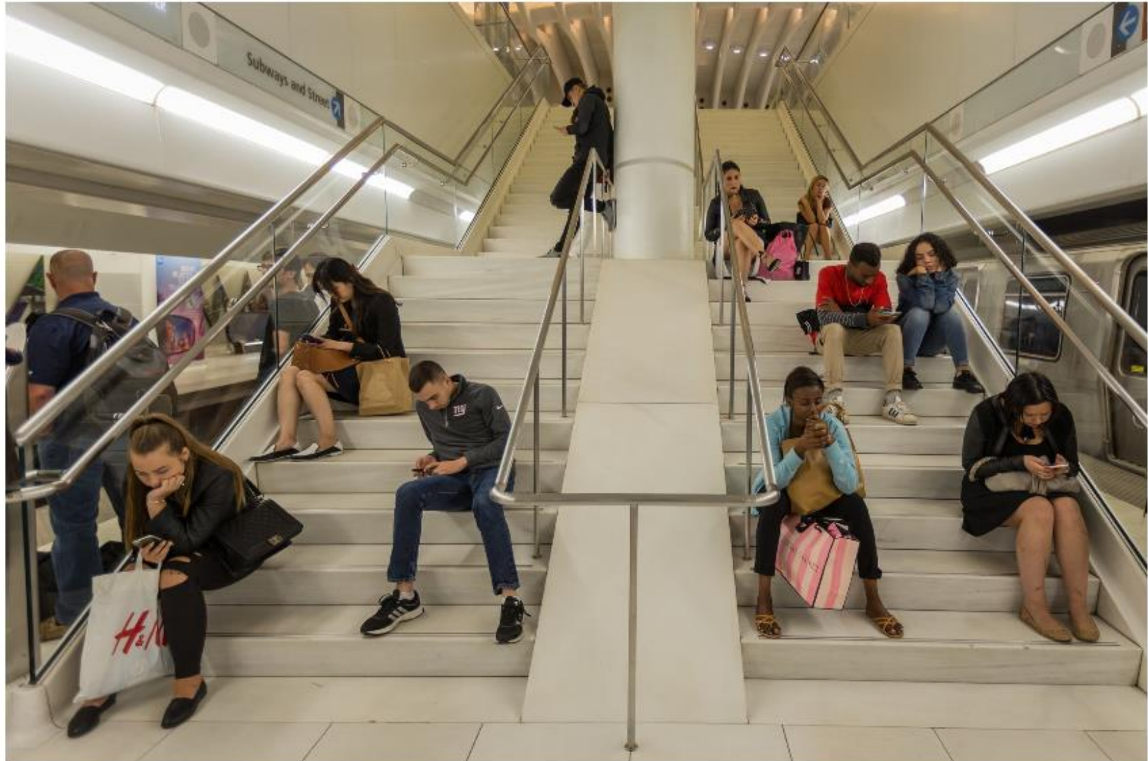
Facebook, Google and others positioned themselves as bettering the world. But their systems and tools have also been used to undermine democracy.