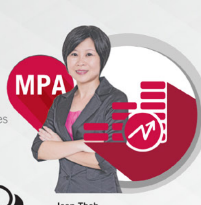
MPA, 2013 Intake Executive Director, UOB Venture Management Pte Ltd